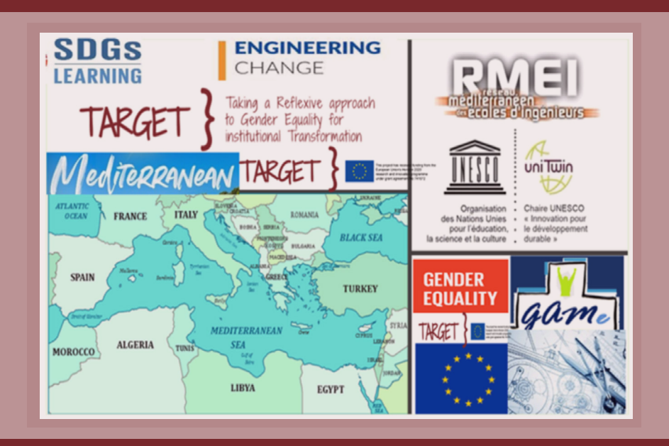
Figure 2. The RMEI system includes Gender Equality objectives: Thriving for a sustainable world, gender equality is important for the network.

The network aims to offer support for the creation of a 'gender equality culture' for all involved members (including professors, students and leaders of the participating engineering institutions) and to inspire gender equality at the member institutions (schools) as a fundamental prerequisite to address the pressing global and local challenges of an environmental, climate, economic and social nature that the Mediterranean is facing today.